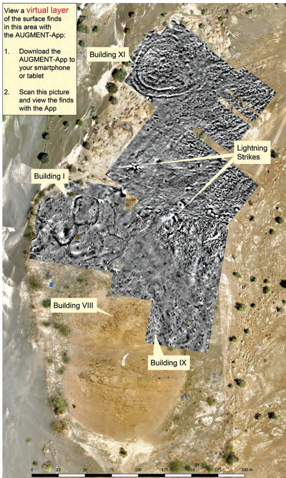
FIGURE 3. Results of the two magnetic surveys at Building I. The magnetic gradiometry survey (dynamics \pm 8 nT from black to white) in the south reveals patterns of activity at Building I and the footprints of several tumuli. Total field magnetometry (dynamics \pm 30 nT from black to white) has revealed the presence of a previously undocumented building complex, Building XI, surrounded by two concentric ditches.