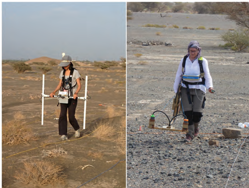
FIGURE 2. The Tübingen survey with the magnetic gradiometer (left) and the LMU team with a total field magnetometer (right).

covered by a sand sheet or other sediments, making this area magnetically ‘noisy’. The complete form of this structure and the purpose of these remains have not been determined, and the potential for doing so remains low owing to the extremely deflated context.