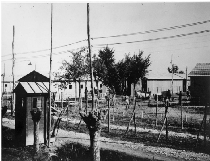
Figure 7. Fossoli Camp, 1943.

The Old Camp, meanwhile, became a concentration camp for civilian internees which fell under the authority of the Police Headquarters in Modena and essentially fulfilled public safety purposes. The prisoners of the Old Camp (citizens of enemy nationalities, parents of national service dodgers, and common convicts) were not ordinarily destined to be deported, but various testimonies document that civilian internees who were considered dangerous were taken out of the Italian camp and added to the trains bound for the camps of the Reich. Little is known of how the Italian authorities managed this area of the Camp as it was demolished in 1946, nor how many people were confined, abused or killed (Ropa 2016).