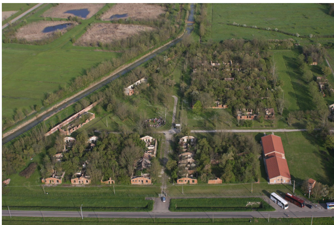
Figure 1. Aerial photograph of Fossoli Camp.

This paper is based on historiographical sources and testimonies as well as the direct experience of the site's management team. Since its creation in 1996, the Fossoli Camp Foundation has been committed to enhancing the history and heritage of the former Fossoli concentration and transit camp through the preservation of a complex memory space. The heritage assets of the Foundation also include an important museum dedicated to political and racial deportees, an archive, and the old synagogue of Carpi.