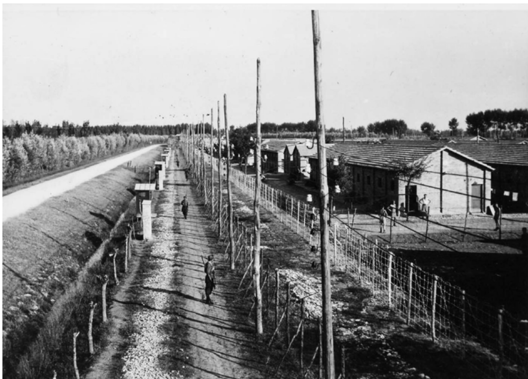
Figure 6. Fossoli Camp, 1943.