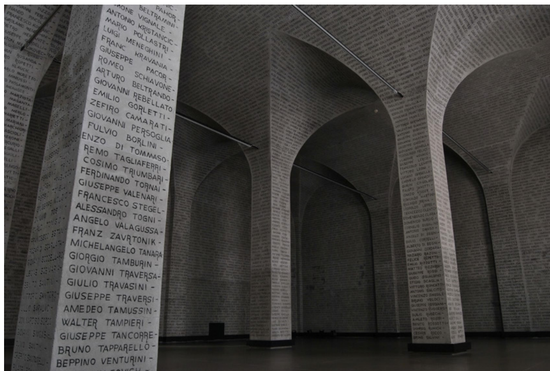
Figure 11. Hall of Names in Museum and Monument to the Racial and Political Deportee.