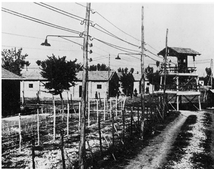
Figure 8. Photograph of the watchtower located in the external perimeter of the Fossoli Camp, 1943.

The advance of the front line, the danger of bombings, and the escalation of the partisan fight made the camp unsafe and difficult to control, so at the end of July, the German command decided to close it down and move the internees to Gries Camp, in the suburbs of Bolzano. The entire German Headquarters was transferred to Gries, along with the last remaining internees who would be deported from Bolzano over the following days. Gries Camp was active from the summer of 1944 until the end of the war (Venegoni 2004; Di Sante 2019).