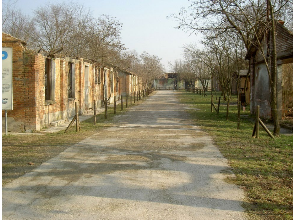
Figure 2. View of Fossoli Camp.

Fossoli Camp was originally composed of two areas: the Old Camp and the New Camp. The Old Camp, which was constructed three months before the New one, was demolished in 1946, so the camp seen today on Remesina Road is the New Camp.