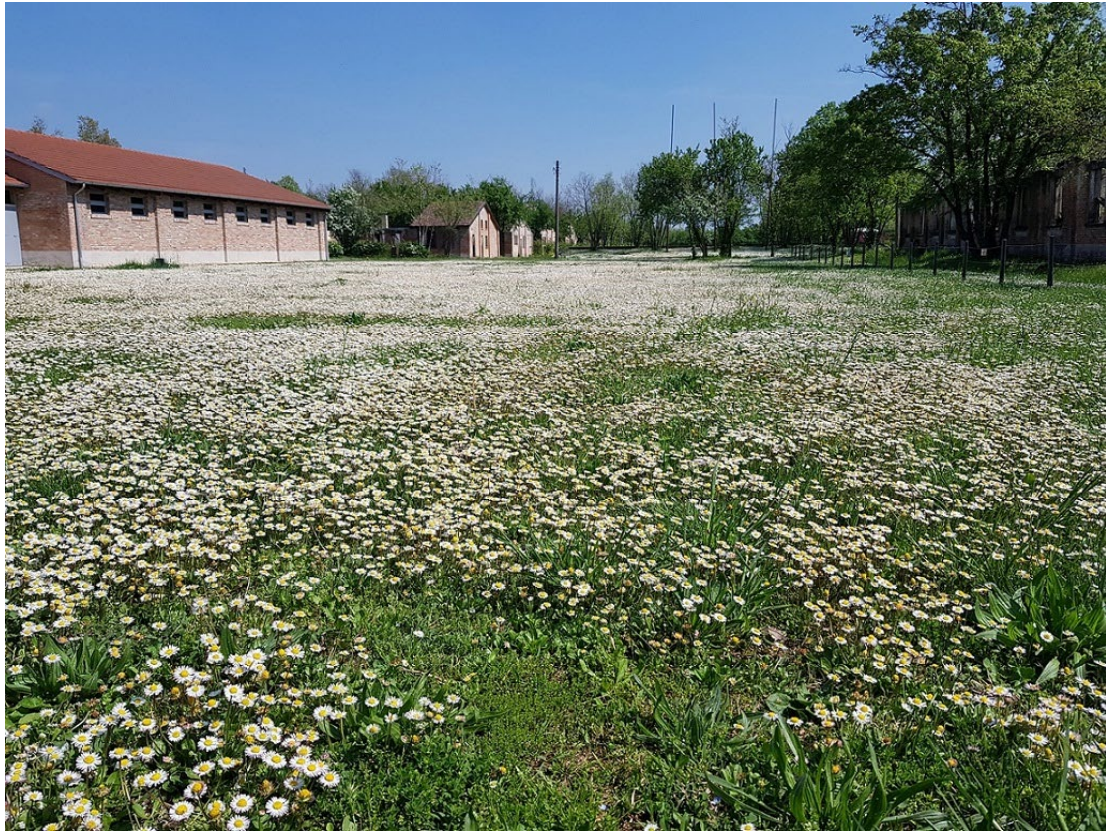
Figure 4. View of Fossoli Camp.