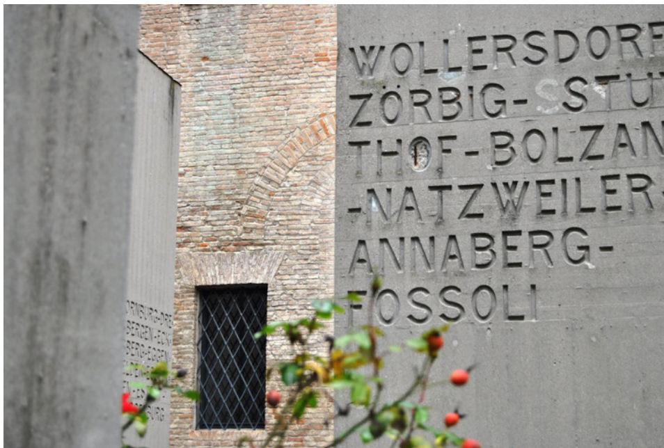
Figure 10. Detail of the Courtyard of the Stele, Museum and Monument to the Racial and Political Deportee.