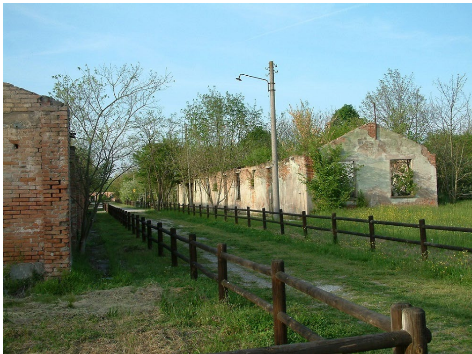
Figure 3. View of Fossoli Camp.