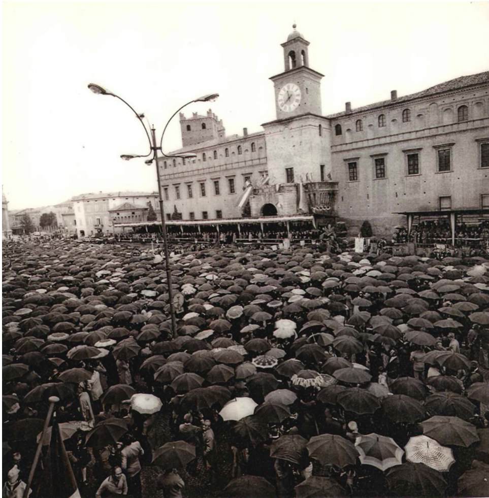
Figure 9. Inauguration of the Museum and Monument to the Racial and Political Deportee, 14 October 1973.