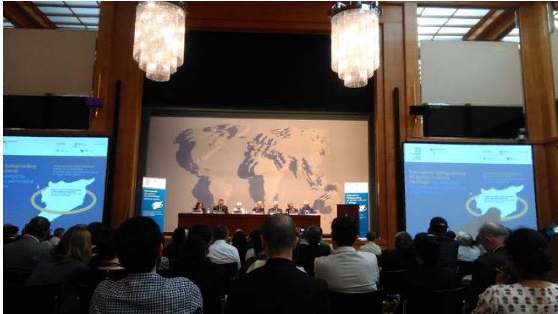
Figure 5. The plenary session that concluded the conference - by the author - 4 June 2016.

Over the past few years, UNESCO and its partners have been working on several levels to promote the protection of cultural heritage in conflict zones, in particular in Syria, Iraq, Yemen, Mali and Libya. After the “liberation” of Aleppo at the very end of 2016, UNESCO conducted a first emergency assessment of the damages of the old city of Aleppo. Later on, UNESCO hosted the First International Coordination Meeting for the recovery of Aleppo’s heritage in Lebanon in March 2017 to set up the actions plans for restoring the old city of Aleppo. However, the UNESCO efforts are limited to the international law which prohibits the United Nations specialized agency in heritage from collaborating with non-state actors. In other words, UNESCO could not provide capacity building training for entities that did not sign The Hague convention of 1954. This has showed how cultural heritage cannot be fully protected in the framework of the UNESCO work mechanisms. In my view, there has to be a parallel system that would initiate and fund projects to protect, conserve and rebuild heritage with no limitations, in a way that would neutralize cultural heritage and deploy it for post-war recovery plans in effective way.