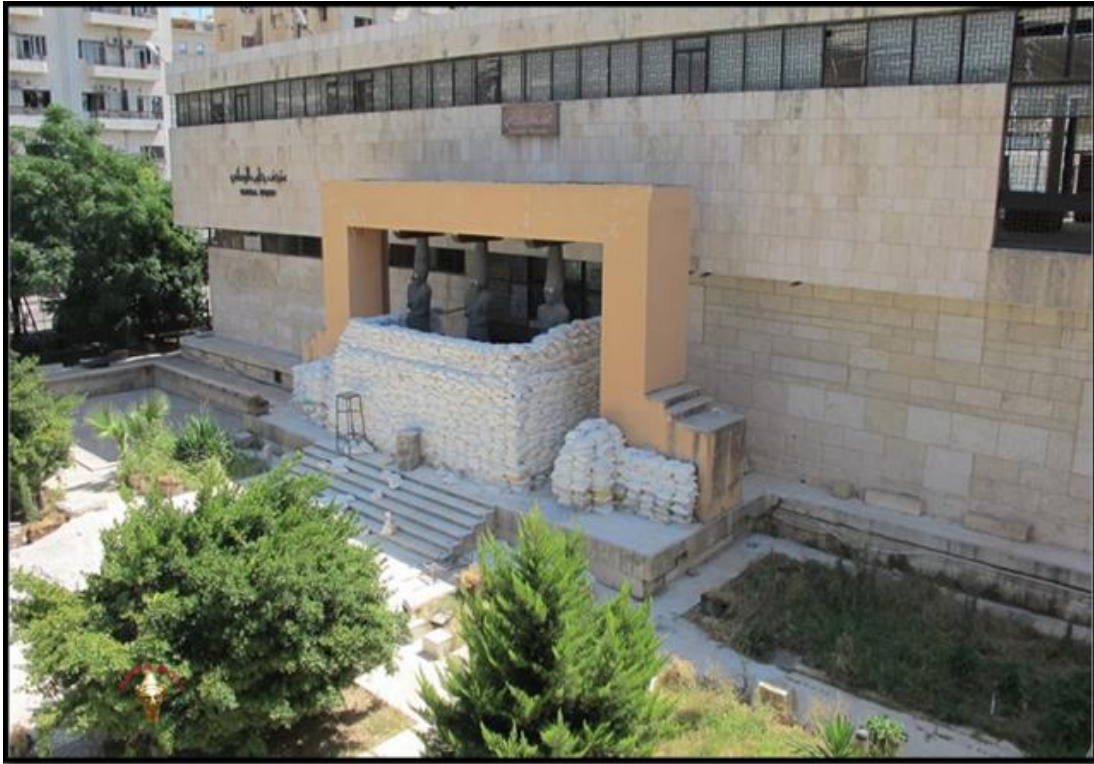
Figure 4. Protecting the façade of the National Museum of Aleppo city. The Association for the Protection of Syrian Archaeology (ASPA), 2013.

locals in the process of protecting heritage in a way that would respect the cultural diversity and the local values.