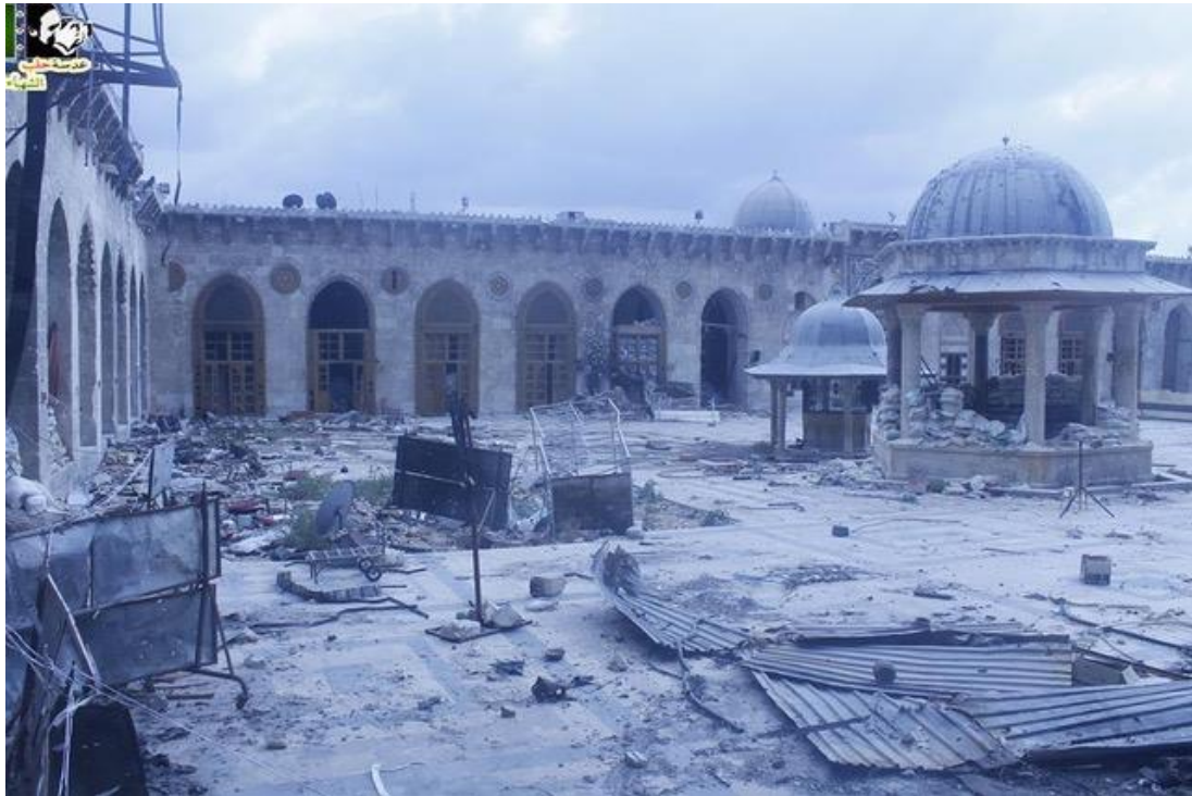
Figure 2. The Great Umayyad Mosque - Lens of Aleppo Alshapa - Sep. 2013

tural Heritage Center. These institutions fund in-loco training programs with heritage experts, museum curators, and civilians in order to raise awareness for the protection of cultural heritage in the areas controlled by the rebels. The third speech was by Ammar Kannawi, the former curator at the National Museum of Aleppo. He explained the need to establish a database and to document the destruction that occurred to the site of Ebla and the mosaic museum in Maarrat al-Nu'man in Northern Syria (Fig. 3). This series of professionals' presentations ended with the Syrian archaeologist, Houmam Saad, who presented the collaborative project with ICONEM to create 3D documentation of the World Heritage Site of Palmyra.