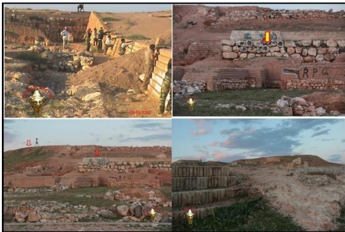
Figure 3. Violations to the site of Ebla - Northern Syria, 23-04-2013. The Association for the Protection of Syrian Archaeology (ASPA), April. 2013