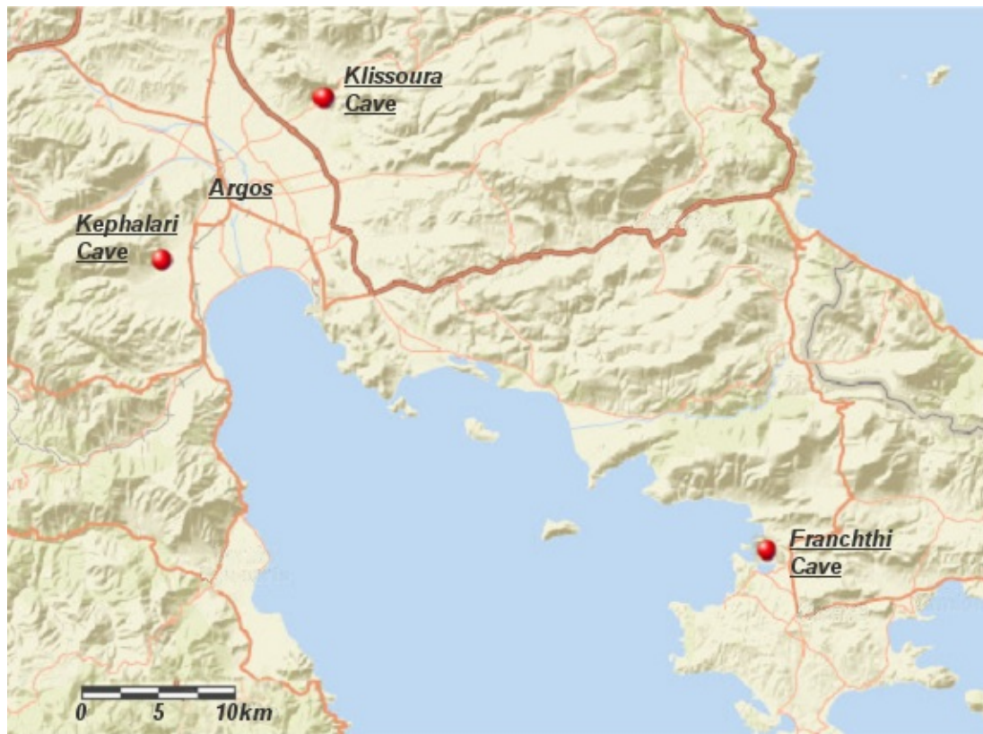
Figure 1. Location of the three major caves mentioned in the text. The position of Ulbricht Cave is unknown, probably to the north of Klissoura.

All sites and findspots are located below 200masl on low hills surrounding larger plains and river valleys (Elefanti & Marshall 2015). The excavated caves of Kephalaria and Klissoura are located on the western and eastern edges of the Argive Plain respectively, while Franchthi Cave lies close to the south-eastern end of the peninsula. The location of Ulbrich Cave which was excavated in the late 1920s by Adalbert Markovits is currently unknown, although it was probably located to the north of the Argive Plain and south of the Nemea Valley (Galanidou 2003: 107–108).