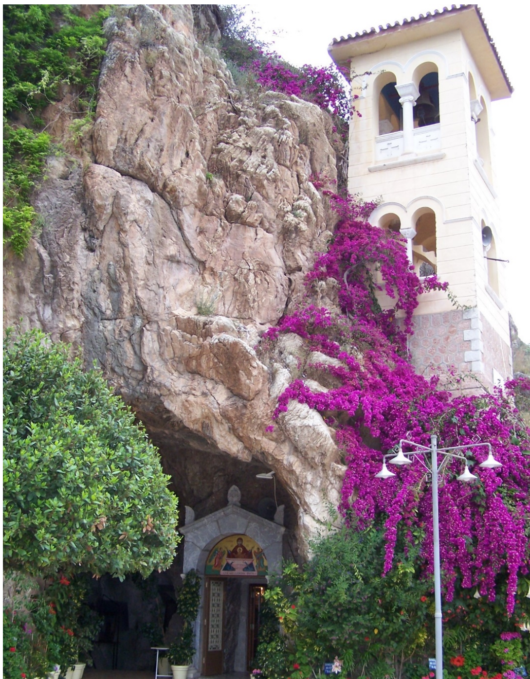
Figure 2. Kephalaria Cave showing the smaller right hand entrance and the façade of the church of Zoodochos Pigi.

Excavations were carried out approximately a third of the way into the main chamber in the mid-1970s by Rainer Felsch and then Ludwig Reisch (1976), producing an Upper and Middle Palaeolithic sequence. The Upper Palaeolithic chipped stone assemblages were similar to those from nearby Klissoura Cave, with Aurignacian, Mediterranean Gravettian and Epigravettian facies. Sandwiched between the Middle Palaeolithic and Aurignacian, was a thin horizon of Uluzzian character (Marshall in prep). Preliminary faunal analysis points to hunting of European fallow deer, roe deer, red deer, aurochs, European ass, boar, ibex and chamois. Smaller species were also targeted, ground nesting birds, hare and tortoise, along with small scale fishing (Starkovich & Ntinou 2017; Starkovich et al. 2018),