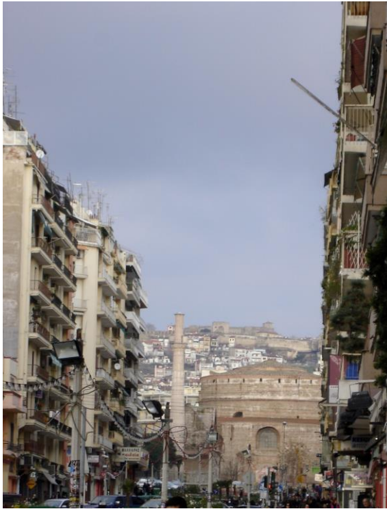
Figure 1. Monuments and sites often dominate city centers. The Arch of Galerius, the Rotunda and the Byzantine city walls in Thessaloniki