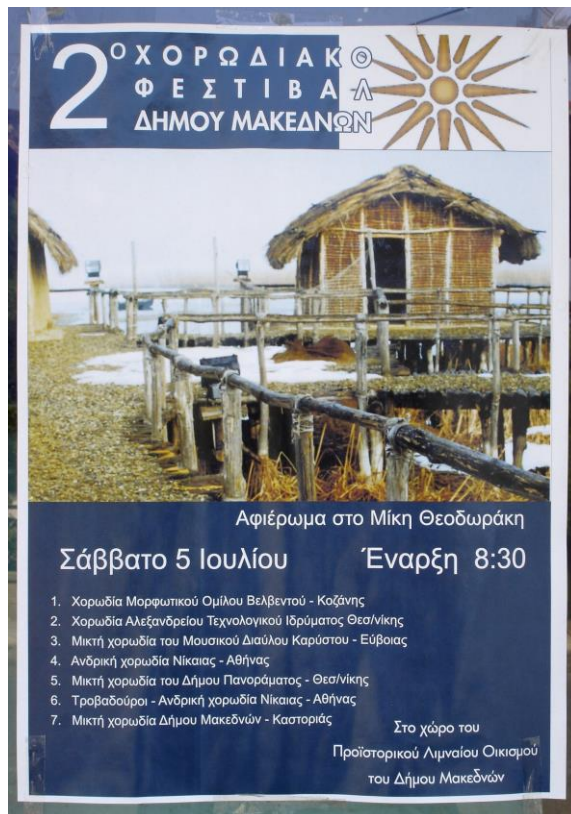
Figure 3. The poster for the promotion of the City's chorus festival in Dispilio in 2008 used an image of the prehistoric lake settlement reconstruction and the so-called Vergina star although the festival was dedicated to contemporary music. The festival took place at the reconstruction site.

He applied his views in the design of the prehistoric exhibition at the Archaeological Museum of Volos, where artifacts were displayed outside of glass cases, using common materials for the Neolithic period, such as wood and clay, and contextualised according to use rather than in typological or chronological sequences. As director of the university excavation of the lake settlement of Dispilio he tried to materialise his belief that '...an excavation is not a simple process of discovery of artifacts but an invitation to participate in the creation of another culture, the formation of a different human, the setting up of another, new and just society' (Chourmouziadis 2008; Chourmouziadis 2002; Kotsakis 2019).